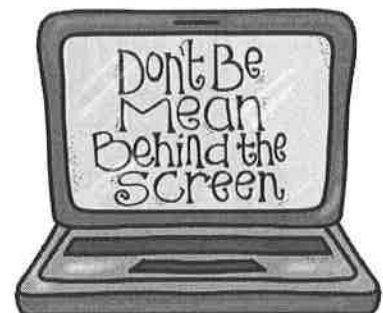
Graphic by Educlips

Description: Disney's Wild About Safety with Timon and Pumbaa: Safety Smart Online is a DVD that helps younger children understand about the internet and how to be safe online. The link above is to purchase the video on Amazon.